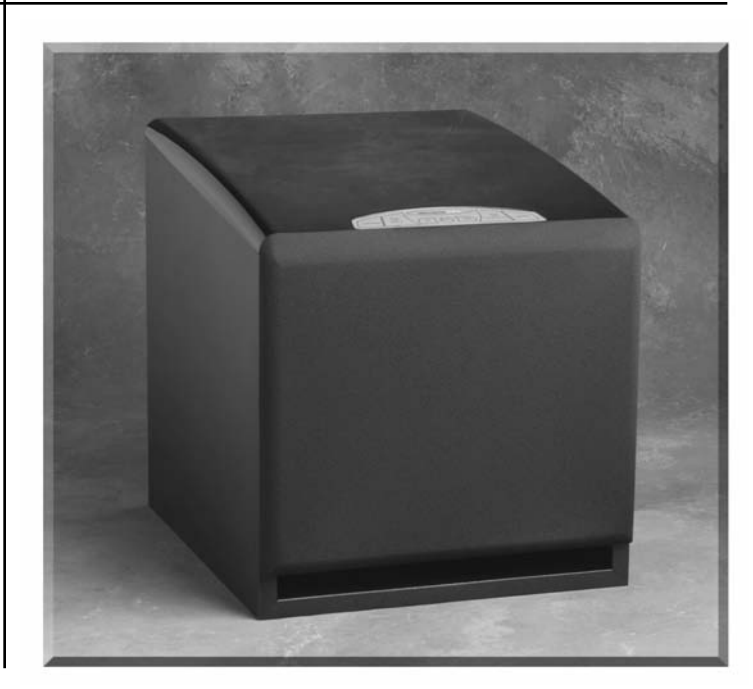
Audio/Video Subwoofer System