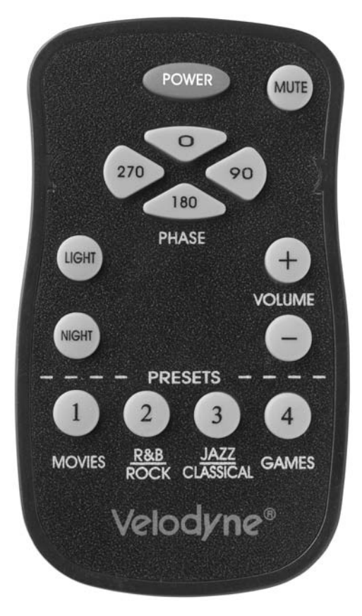
Figure 3. Remote Display

Figure 3 shows the remote control, enabling you to easily choose whatever listening mode you desire.