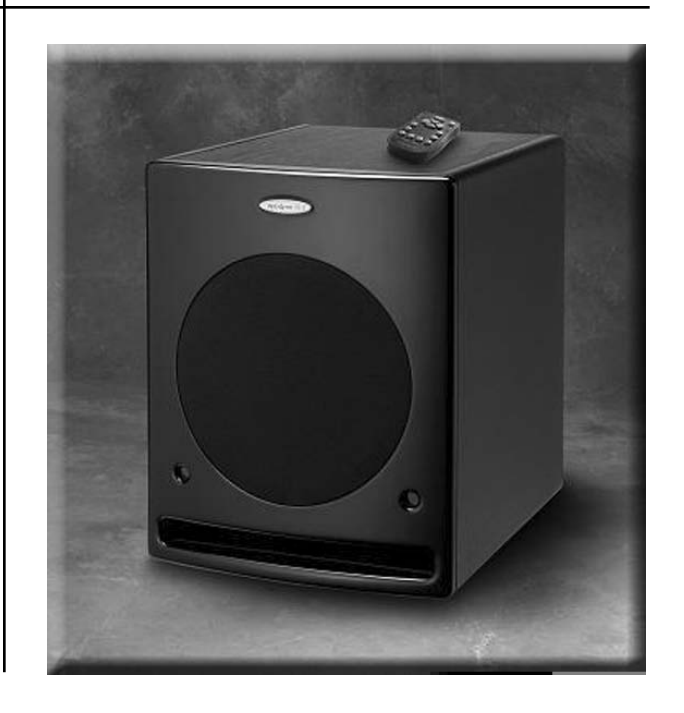
DSP-Controlled Home Theater Subwoofer