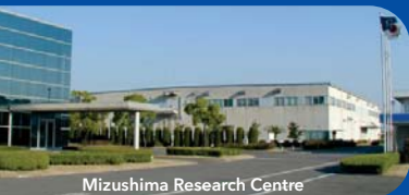
Mizushima Research Centre

Verbatim is a subsidiary of Mitsubishi Kagaku Media, based in Japan. Mitsubishi Kagaku Media's wide-range of operations makes it one of the leading chemical companies in the world.