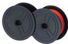
7010 Twin Spool Ribbon