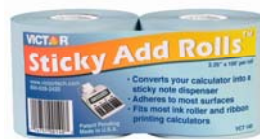
140 Sticky Add Roll