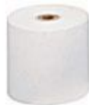
7050 Paper Rolls