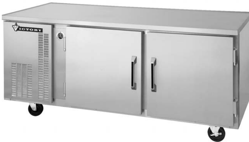
UFS-2-S7 Stainless Steel Tops are Optional

Remote Model Available (Two Section Model Only)