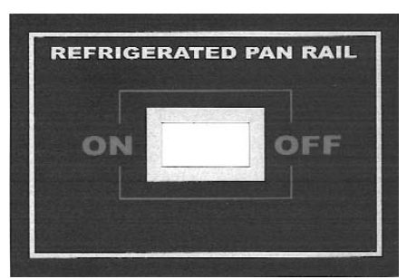
"Refrigerated Pan Rail Label"

The pan rail is "ON" when the night switch inside the refrigerated pan rail label displays a green light. "OFF" position is indicated when the night switch is not displaying a green light. See "Refrigerated Pan Rail Label".