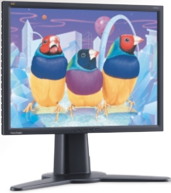
VP201b shown. Also available in silver (VP201s)

Immerse yourself in the panorama of this big-picture LCD.