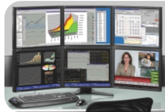
ThinEdge design is ideal for multi-panel setups. Four unit panel-module-only (without base) multi-packs available.

Turn your ideas into breathtaking reality with the 20" VP201s and VP201b LARGE-SCREEN THINEDGE ULTRA-SLIM BEZEL LCD displays. With astounding 176° ultra-wide viewing angles, UXGA 1.92 megapixel resolution, ClearMotiv™ broadcast-quality video technology and native HDTV high-scan 720p compatibility, these displays boost professional productivity and heighten user enjoyment for video editors, financial traders, CAD/CAM engineers and power gamers. Ideal for multiple-panel configurations with height/pivot adjustments, digital/analog inputs and USB 2.0 high-speed connectivity, the VP201s and VP201b are the infinitely versatile professional desktop displays of choice.