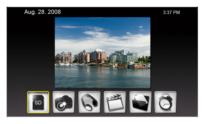
Card Photo Music Video File Time

In Select Mode, you will see the screen below. There are 6 options: Card Selection, Photo, Music, Video, File Management, and Time. Please highlight the desired mode and press ENTER.