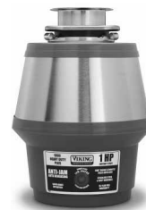
VCFW1000 1 HP