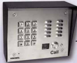
Viking Model K-1705-3

Connecting Viking products to Your Network or the Internet