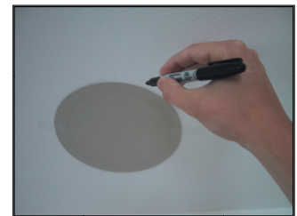
Figure A: Mark cutout area

Note: If cable is to be run through walls or ceilings, the cable must be UL and CL rated for your safety and building code compliance.