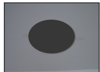
Figure C: Cut speaker hole