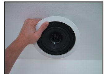
Figure D: Install the speaker

12: Make the final adjustments to the pivoting tweeter and reinsert the grill into the speaker baffle.