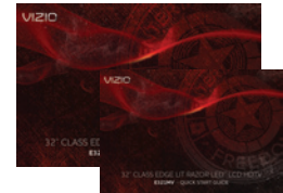
User Manual and Quick Start Guide