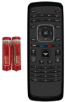
Remote Control with Batteries