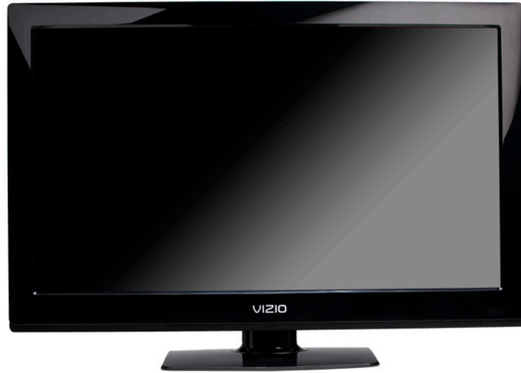
VIZIO LCD HDTV with Base