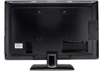
Back of TV