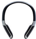
Surround Sound Headphones