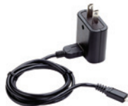
USB Cable with Power Plug