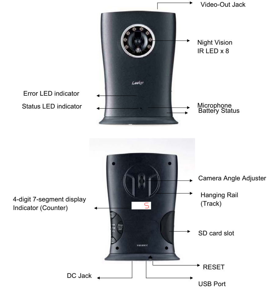
Download from Www.Somanuals.com. All Manuals Search And Download.