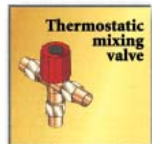
Thermostatic mixing valve

Supplied with the boiler, the thermostatic mixing valve helps to maintain a constant domestic hot water temperature, mixing the hot water output from the coil with fresh cold water fill.