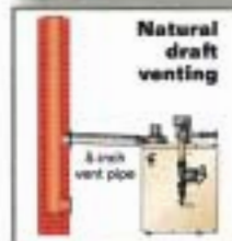
Natural draft venting

Direct exhaust venting uses the boiler's induced draft fan to "push" flue products out the vent. The boiler uses inside air for combustion. Vent pipe is 3-inch type AL29-4C® and can be routed through a side wall or vertically through the roof. Direct-exhaust-vented CGt boilers are classified Category III (pressurized vent and flue gases hot enough to avoid excessive condensation).