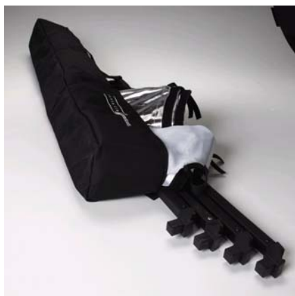
Scrim Jim Carry Bag

These kits contain (1) Frame, (1) Single Black net, (1) ¾ Stop Diffusion Panel, (2) Grip Heads, (2) Scrim Jim Clamps and (1) Carry Bag. Just add stands and you are ready to go.