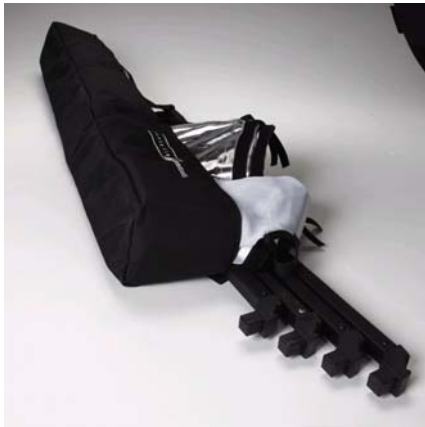
Scrim Jim Carry Bag

These kits contain (1) Frame, (1) Single Black net, (1) ¾ Stop Diffusion Panel, (2) Grip Heads, (2) Scrim Jim Clamps and (1) Carry Bag. Just add stands and you are ready to go.