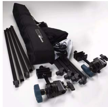
Scrim Jim Video Broadcast Deluxe Kit