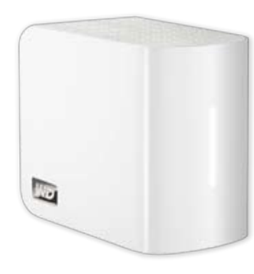
Relax! Double-safe continuous backup for all the computers on your network.

Automatic, Continuous Backup Dual-drive Protection Media Sharing and Streaming