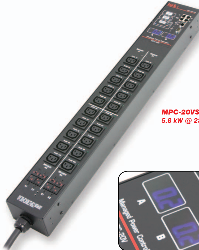
MPC-20VS32-3 5.8 kW @ 230V