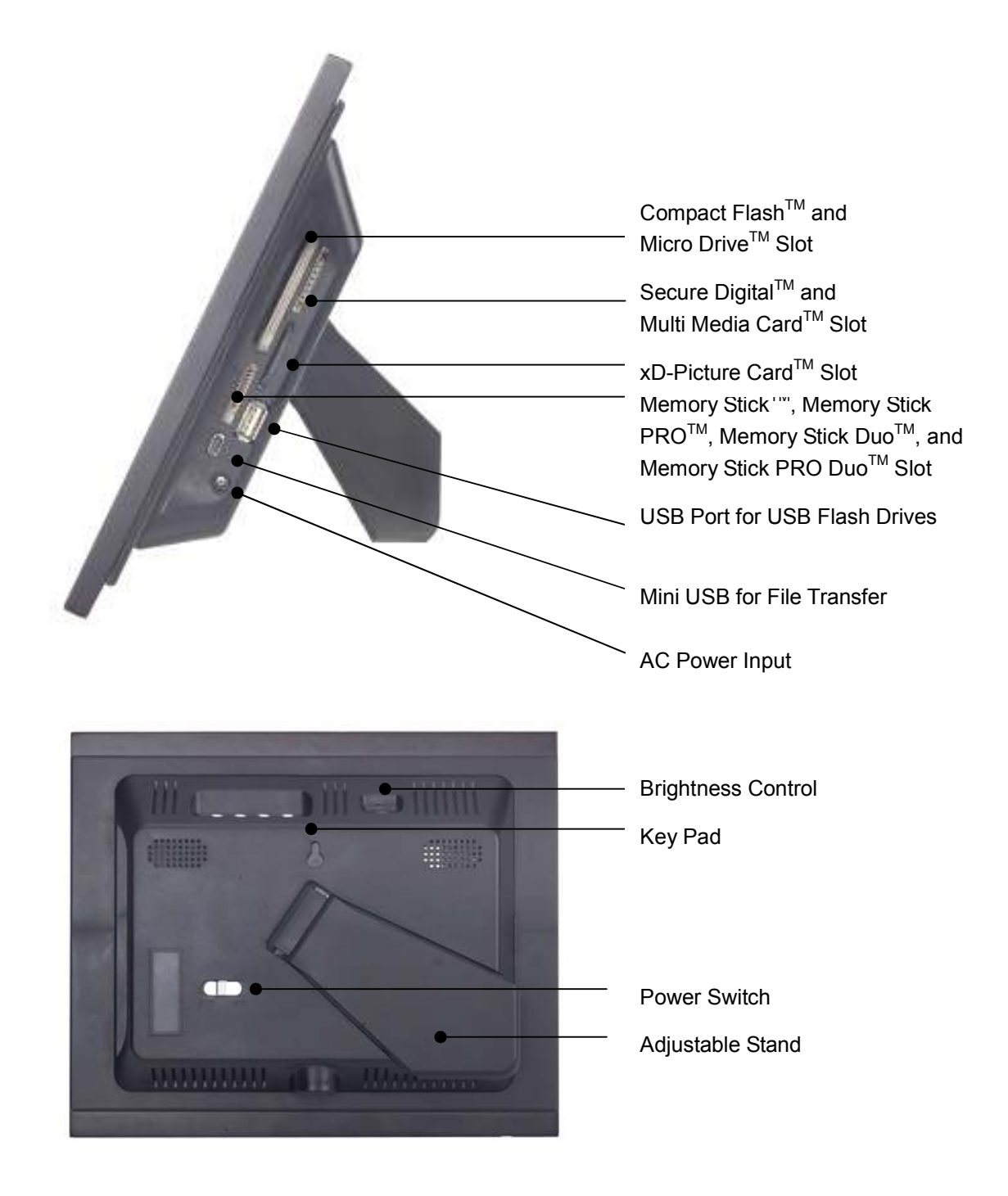
Diagram of the Digital Photo Frame