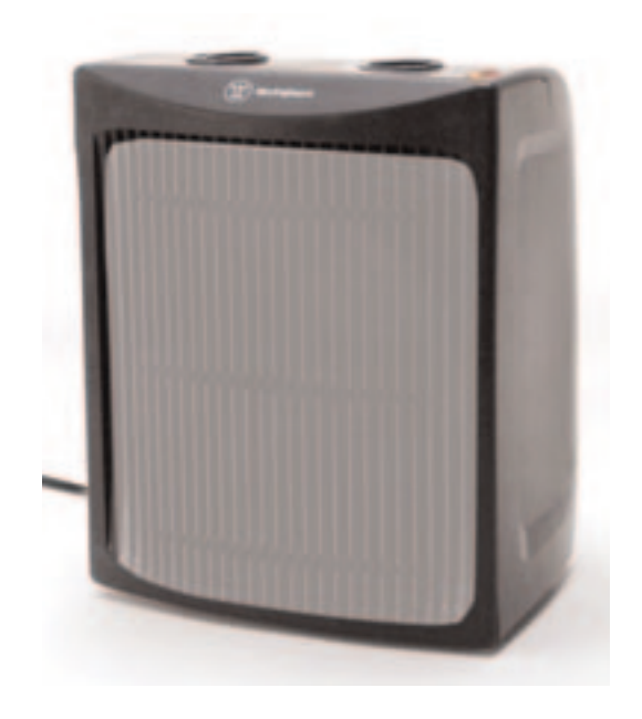
WST6004 Upright Heater