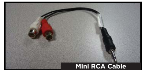
Mini RCA Cable