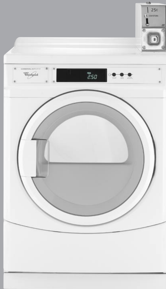
Shown with optional pedestal, coin drop and box.