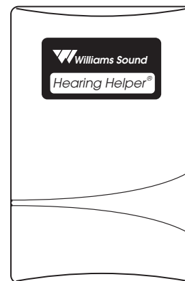
TGS R30 Front

NOTE: SPECIFICATIONS SUBJECT TO CHANGE WITHOUT NOTICE!