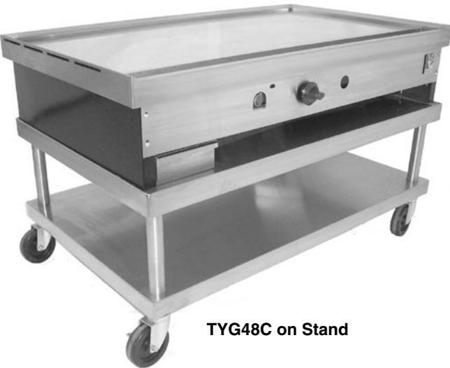
TYG48C on Stand