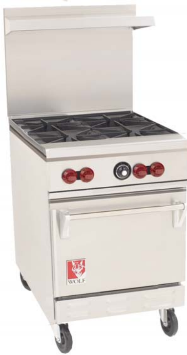
Model C24S-4 shown with optional casters