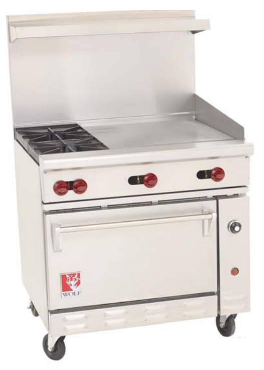
Model C36S-2FT24 shown with optional casters