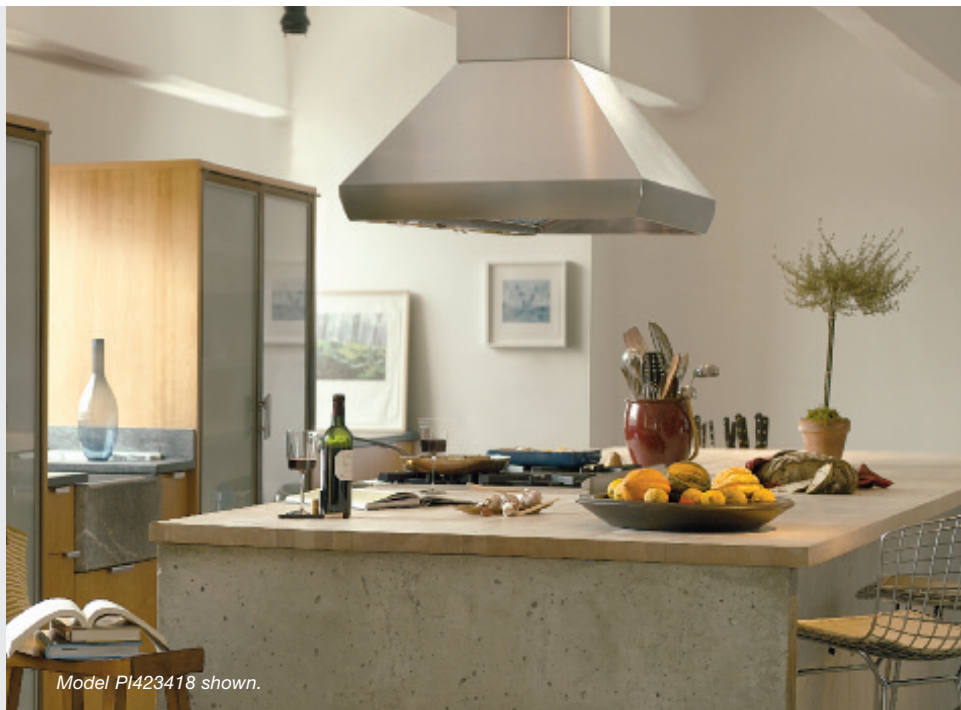
Model PI423418 shown.

With standard features like heat sentry and dual setting halogen lighting, Wolf pro island hoods provide the ultimate in ventilation. Pro island hoods are available in four widths.