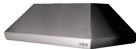
Model PI543418 Pro Island Hood

Accessories are available through your authorized Wolf dealer. For local dealer information, visit the find a showroom section of our website, wolfappliance.com .