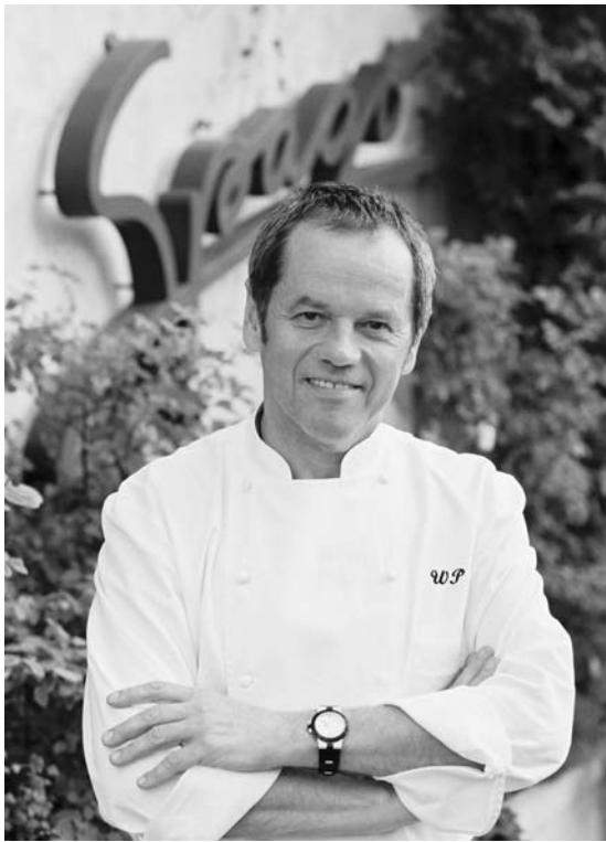
Wolfgang Puck, owner of the famous Spago restaurants and one of the most influential chef-restauranteurs in America, is credited with reviving California's rich culinary heritage. His cooking innovations, a result of blending fresh

California ingredients with his classical French techniques, are enjoyed by world leaders, stars and fellow chefs alike. He established other trend-setting restaurants like Postrio in San Francisco, Chinois on Main in Santa Monica, Vert and Trattoria del Lupo, and his latest creation, Cut, a gourmet steakhouse in the Beverly Wilshire Hotel. Home chefs can also share Mr. Puck's talents through his cookbooks and, of course, through his appliances!