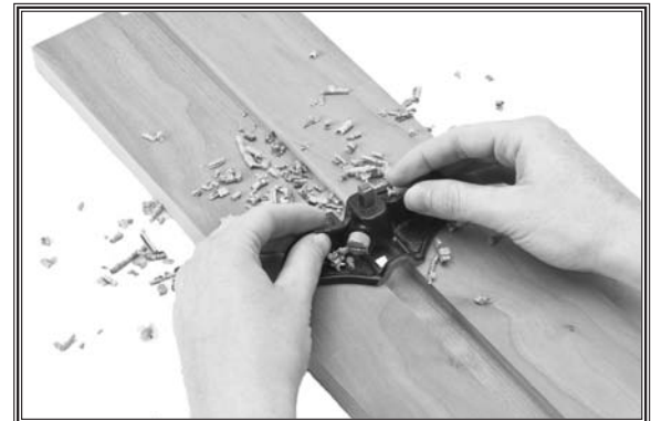
Figure 2. Using router plane.