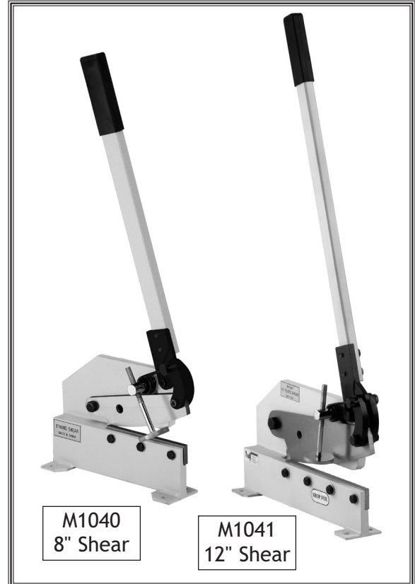
Figure 1. Model M1040 and M1041 Plate Shears.