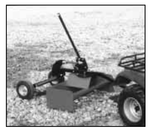
42" Box Scraper Shown