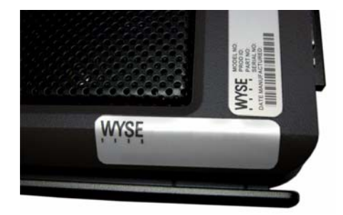
Figure 8 Placement of Wyse Conversion Label

Failure to install the label may cause delays in service and support. The serial number must be given to a Customer Support Technician to validate entitlement to support and service from Wyse. Failure to do so will result in the original operating system being loaded on the device and is in breach of your license agreement.