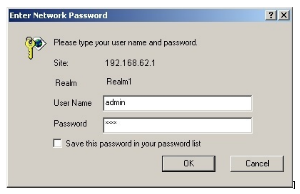
FIGURE 1: Logon dialog box