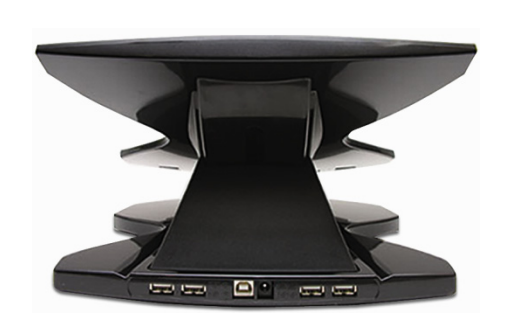
integrated 4 port Hub

stay cool and connected while improving your comfort, workspace and style