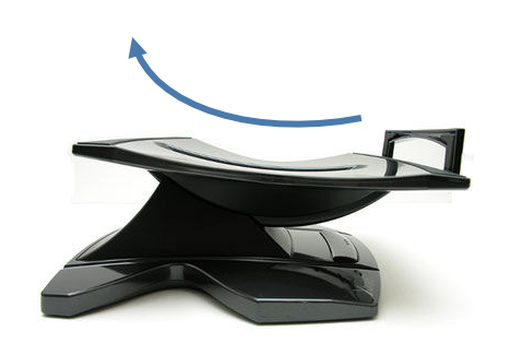
4 height positions