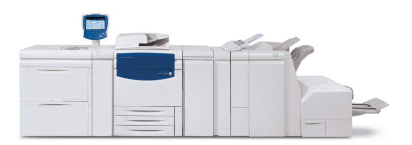
Xerox 700 Digital Color Press

Note: The Xerox SquareFold Trimmer Module requires the Booklet Maker Finisher and can be used with any of the print servers for the Xerox 4112/4127 Family.