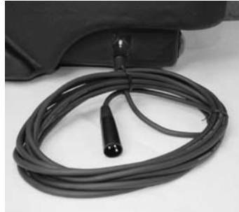
XLR CABLE TO HOUSE PA