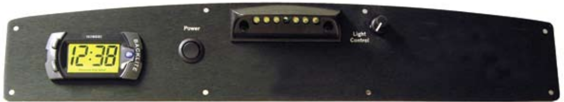
DASHBOARD WITH CLOCK TIMER AND LED LAMP