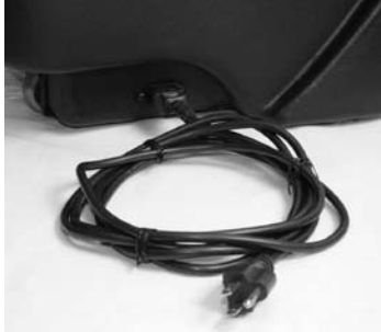
POWER CORD TO HOUSE POWER SUPPLY