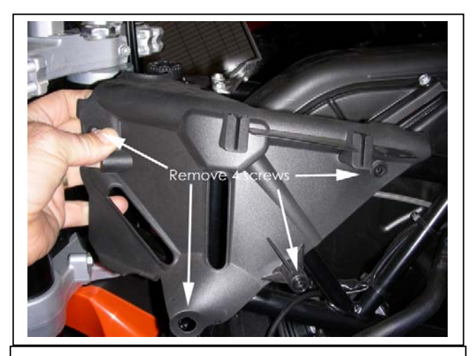
Remove screws here to remove left side panel