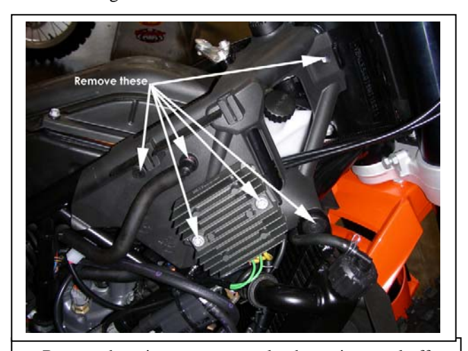
Remove here is you want to take the entire panel off