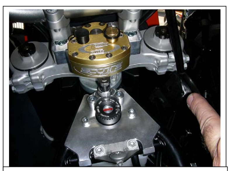
Parts are silver in this photo to show contrast for mounting ease.