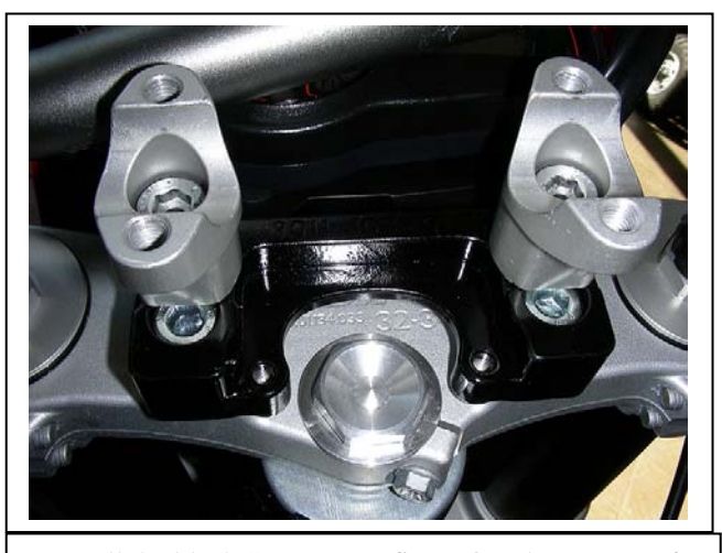
Install the black SUB mount first using the rear set of holes on the triple clamp and tighten the Allen bolts. Then install the stock lower perches and tighten. Perches can be reversed for optional bar positions.