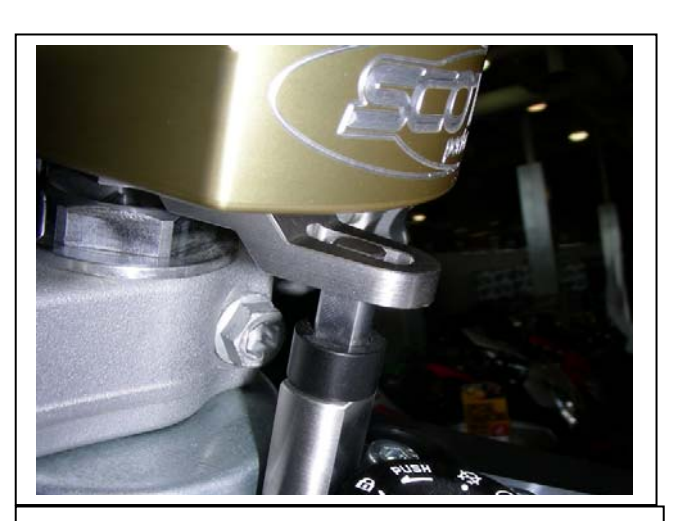
This is the correct tower pin height for this model. Be sure the tower pin does not extend through the slot too far as it can make contact with the damper body. Keep the tower pin greased in the hole.