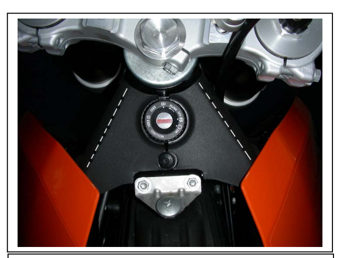
Cut the stock plastic key shrouds along the dotted lines until they match your frame to your satisfaction.