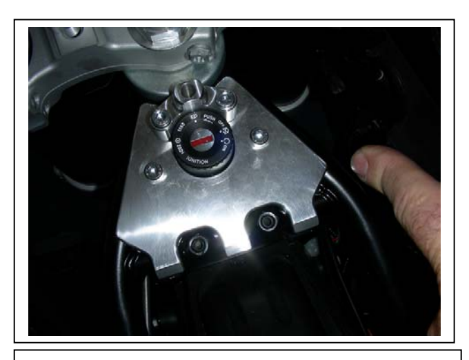
Move the top plate around until it's centered