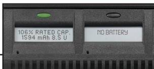
Display shows battery capacity, voltage, charge status and more in real time.