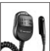
Remote Speaker Microphone PMMN4002