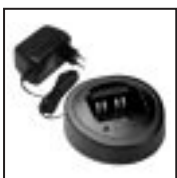
Rapid-rate Desktop Charger PMTN4025