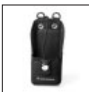
Nylon Carry Case HLN9701