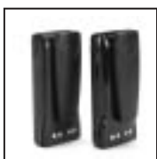
NiMH Battery & Belt Clip PMNN4008