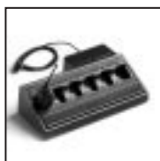
Multi-unit Charger PMTN4028