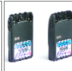
Slim & Hicap Lilon Batteries