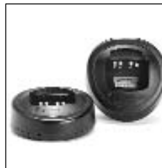
Rapid Rate Desktop Charger

Motorola accessories are built with the highest quality standards and are specially engineered to ensure maximum performance for your radio, no matter what profession you're in.