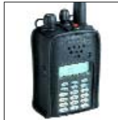
Soft Leather Case with Swivel Clip