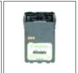
FM NiMH Battery