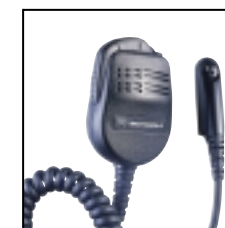
Remote Speaker Microphone