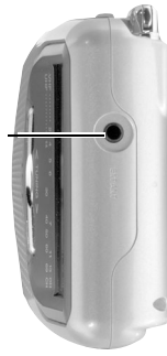
EXT. ANT. Jack

Connect the antenna to the EXT. ANT. jack. If your antenna wire is 75-ohm coaxial cable, use an F-to-mini plug adapter to complete the connection. If you have 300-ohm wire, use a 300-to-75 ohm mini plug adapter. Both are available at your local RadioShack store.