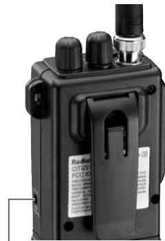
12V DC PWR Jack