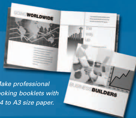
Make professional looking booklets with A4 to A3 size paper.

For instance, the high volume drawer configuration is flexible enough to meet whatever paper requirements you might have. Including the standard 2,500 sheet large capacity main drawer, the system provides 3,600 sheets on line in basic configuration. A 100 sheet Smart Stack Feed bypass and optional 4,000 sheet external LCF provides up to 7,600 sheets on line from five separate sources. You have all the capacity you need, whenever you need it.