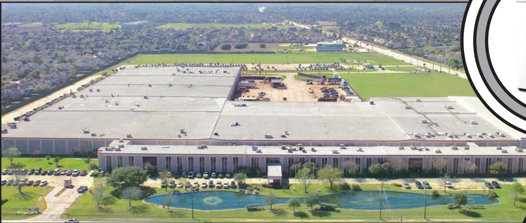
North America Headquarters & Manufacturing Facilities (Houston, TX)