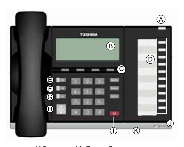
10 Programmable Feature Buttons 4-Line LCD