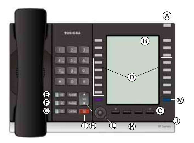
10 Programmable Feature Buttons 9-Line LCD