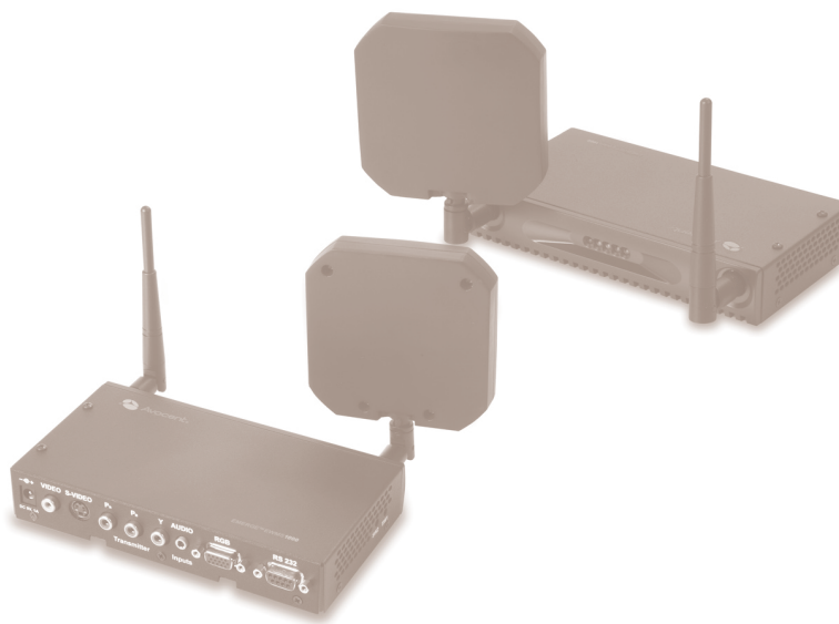
Transmitter and receiver pair with properly aligned antennas

The directional antenna achieves extended range by concentrating its radiated power in a narrow (approximately 30 degree) arc. Therefore, care must be taken to ensure that all receivers paired with a transmitter are located within the 30 degree arc of its directional antenna.