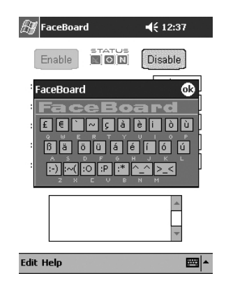
Fig. 7: Unique extended keyboard, the FaceBoard, for easy typing of extra symbols and e-mail smiley patterns.

You can also use an Alternative FaceBoard by activating the on-screen SIP keyboard and then choosing FaceBoard as the input method. (Fig. 8)