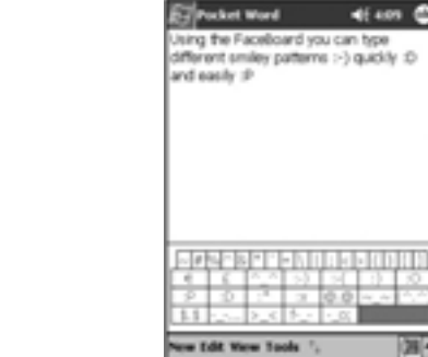
Fig. 5: Alternative Faceboard

This alternative FaceBoard will work better with some applications (such as Inbox).